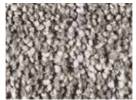
▲ SB: LINS.0221 | 400 & 500 cm