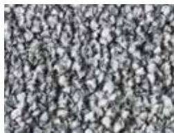
▲ SB: LINS.0820 | 400 & 500 cm