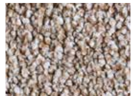
▲ SB: LINS.0270 | 400 & 500 cm