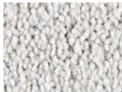
▲ SB: LINS.0440 | 400 & 500 cm