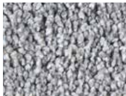
▲ SB: LINS.0850 | 400 & 500 cm