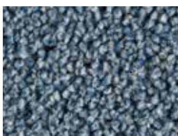
▲ SB: LINS.0760 | 400 & 500 cm