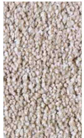
▲ SB: LINS.0250 | 400 & 500 cm