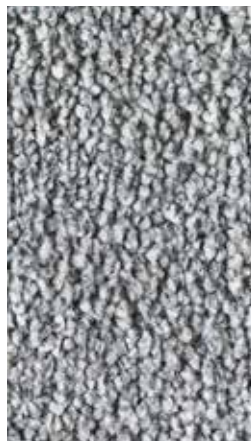
▲ SB: LINS.0840 | 400 & 500 cm