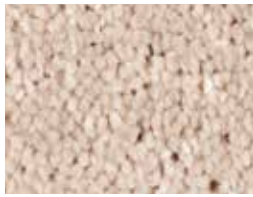
▲ SMB: LSRA.0440 | 400 & 500 cm