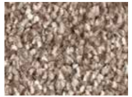
▲ SMB: LSRA.0230 | 400 & 500 cm