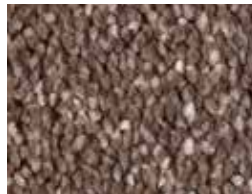
▲ SMB: LSRA.0270 | 400 & 500 cm