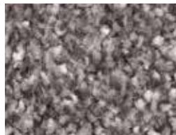
▲ SMB: LSRA.0830 | 400 & 500 cm