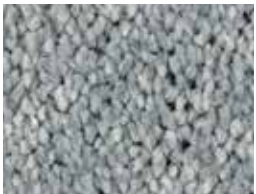
▲ SMB: LSRA.0650 | 400 & 500 cm