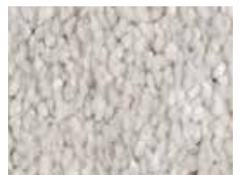
▲ SMB: LSRA.0880 | 400 & 500 cm