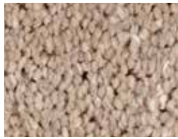
▲ SMB: LSRA.0460 | 400 & 500 cm