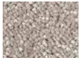
▲ SMB: LSRA.0450 | 400 & 500 cm