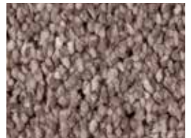
▲ SMB: LSRA.0430 | 400 & 500 cm