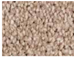
▲ SMB: LSRA.0250 | 400 & 500 cm