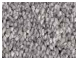
▲ SMB: LSRA.0870 | 400 & 500 cm