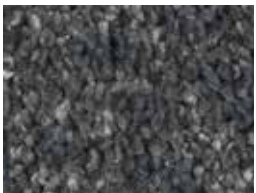
▲ SMB: LSRA.0820 | 400 & 500 cm