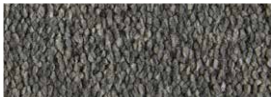
▲ SB: LSWD.0820 | 400 & 500 cm