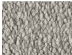
▲ SB: LSWD.0880 | 400 & 500 cm