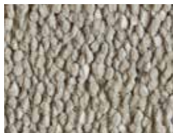
▲ SB: LSWD.0230 | 400 & 500 cm