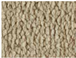
▲ SB: LSWD.0450 | 400 & 500 cm