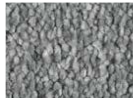
▲ SB: LSWD.0830 | 400 & 500 cm