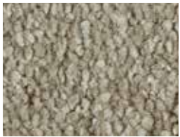
▲ SB: LSWD.0430 | 400 & 500 cm

Luxury saxony with exceptional touch and beautiful finish