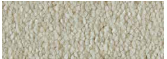
▲ SB: LSWD.0044 | 400 & 500 cm