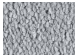
▲ SB: LSWD.0870 | 400 & 500 cm