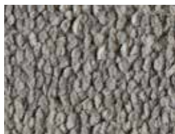
▲ SB: LSWD.0840 | 400 & 500 cm