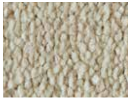
▲ SB: LSWD.0240 | 400 & 500 cm