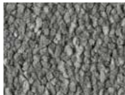
▲ SB: LSWD.0850 | 400 & 500 cm