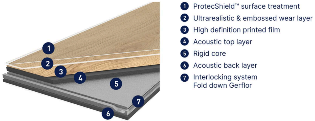
Figure 2: Creation 55 Clic Acoustic