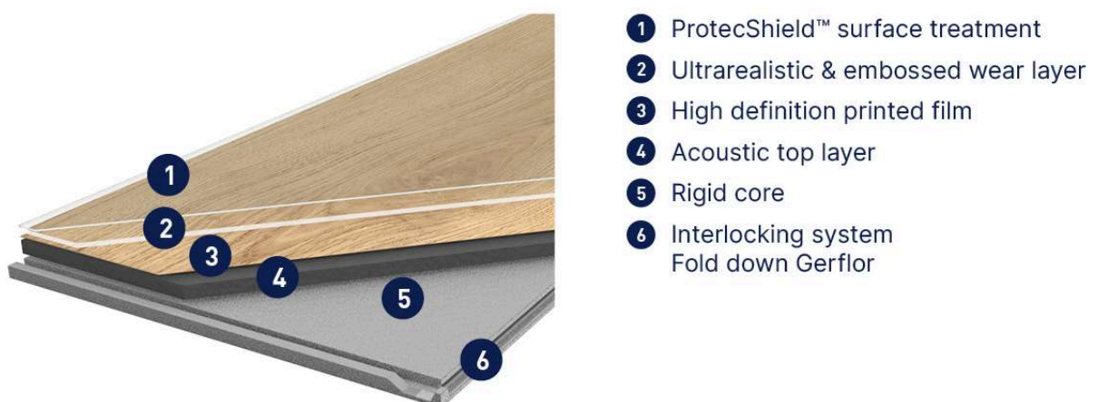
Figure 1: Creation 55 Clic, Creation 70 Clic

The following figure shows the products' constructions: